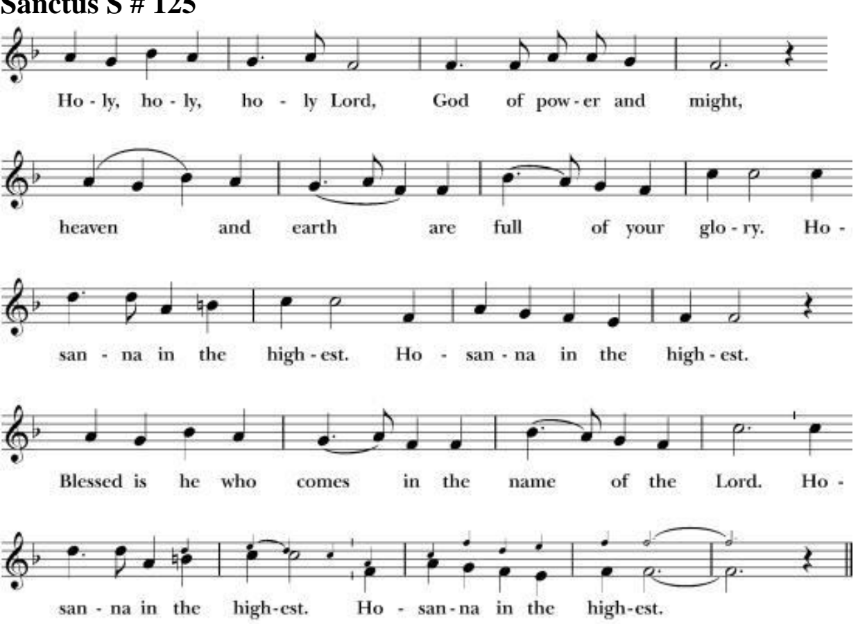
The congregation may wish to sit or kneel for the consecration prayer