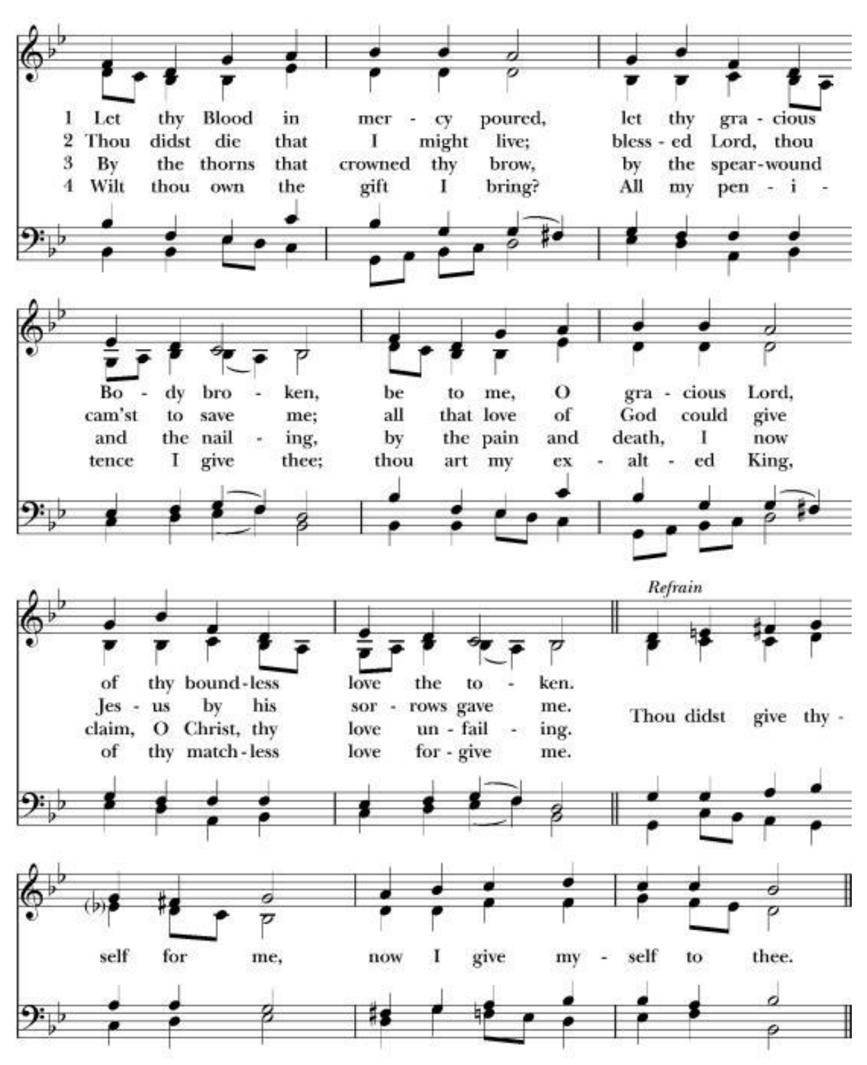
After Communion, the Celebrant says Let us pray.

The People may join in saying this prayer