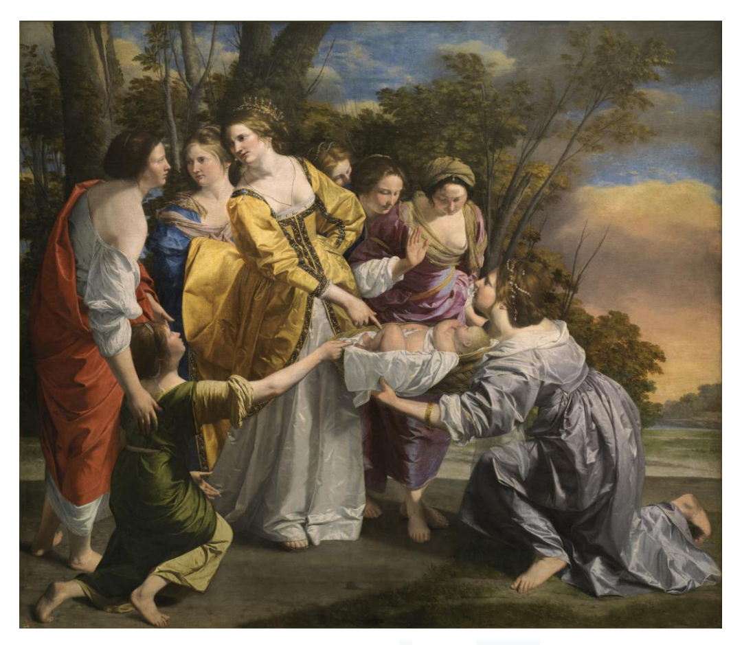
Orazio Gentileschi, Prado, 1633