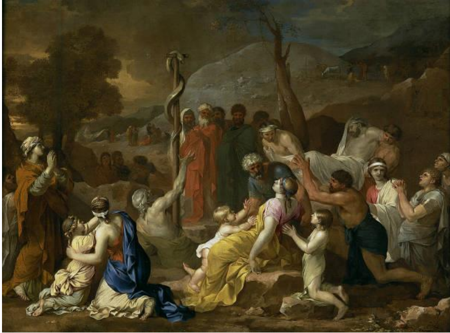
Moses and the bronze serpent in the wilderness Bourdon, Sébastien (1616-1671)