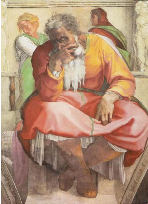
'Jeremiah' by Michelangelo (1508-1512) in the Sistine Chapel.