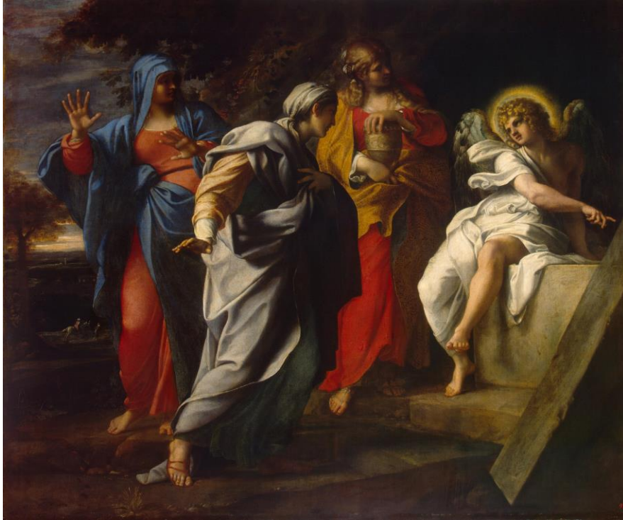
Women at the tomb, by Annibale Carracci, 1598, Hermitage Museum in Saint Petersburg