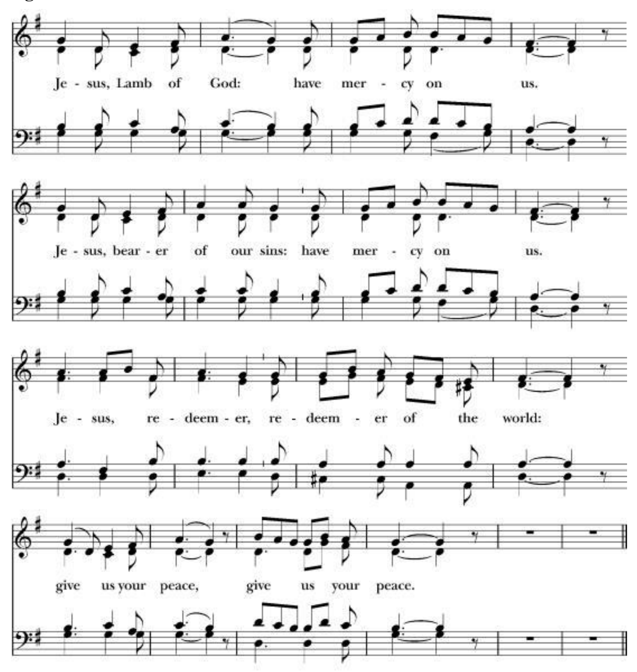
Facing the people, the Celebrant says the following Invitation

The Gifts of God for you, the Beloved People of God. Take them in remembrance that Christ died for you, and feed on him in your hearts by faith, with thanksgiving.