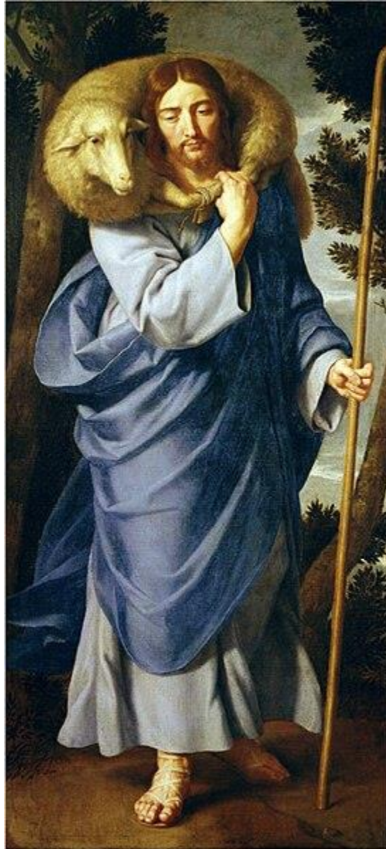
Jean Baptiste de Champaigne, 1631-1681