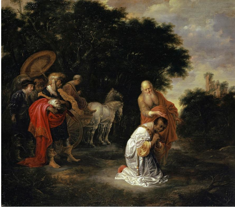
Baptism of the Ethiopian Eunuch Gijsbert Jansz Sibilla (1595/99-1655)