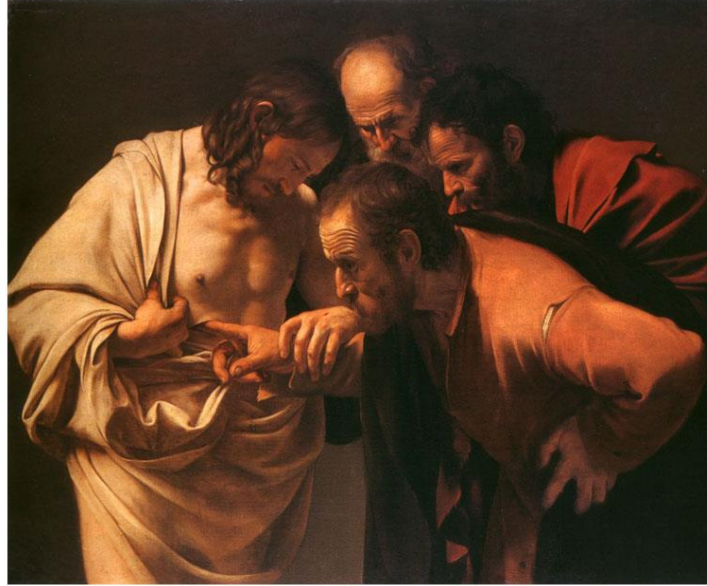
"The Incredulity of Saint Thomas" by Caravaggio, Italian painter, 1601