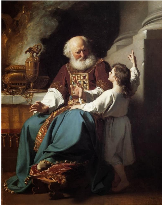
John Singleton Copley, 1780 "Eli and young Samuel"