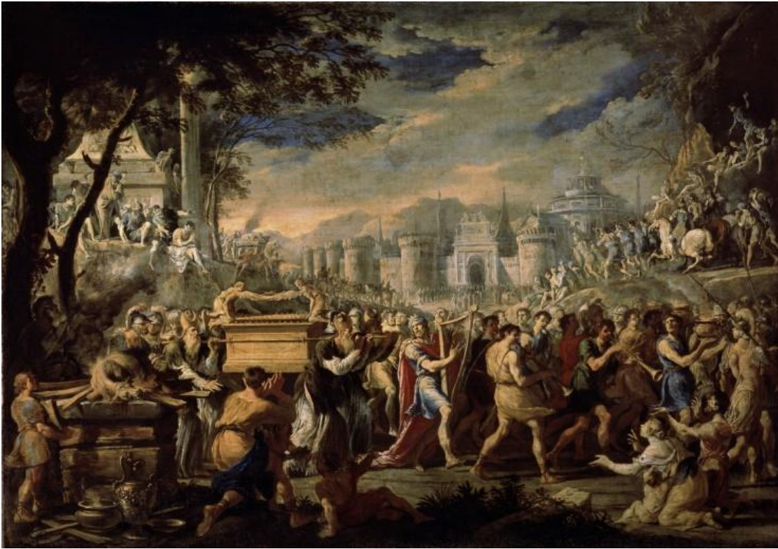
"David and the Ark", Domenico Gargiulo(1612-1675)