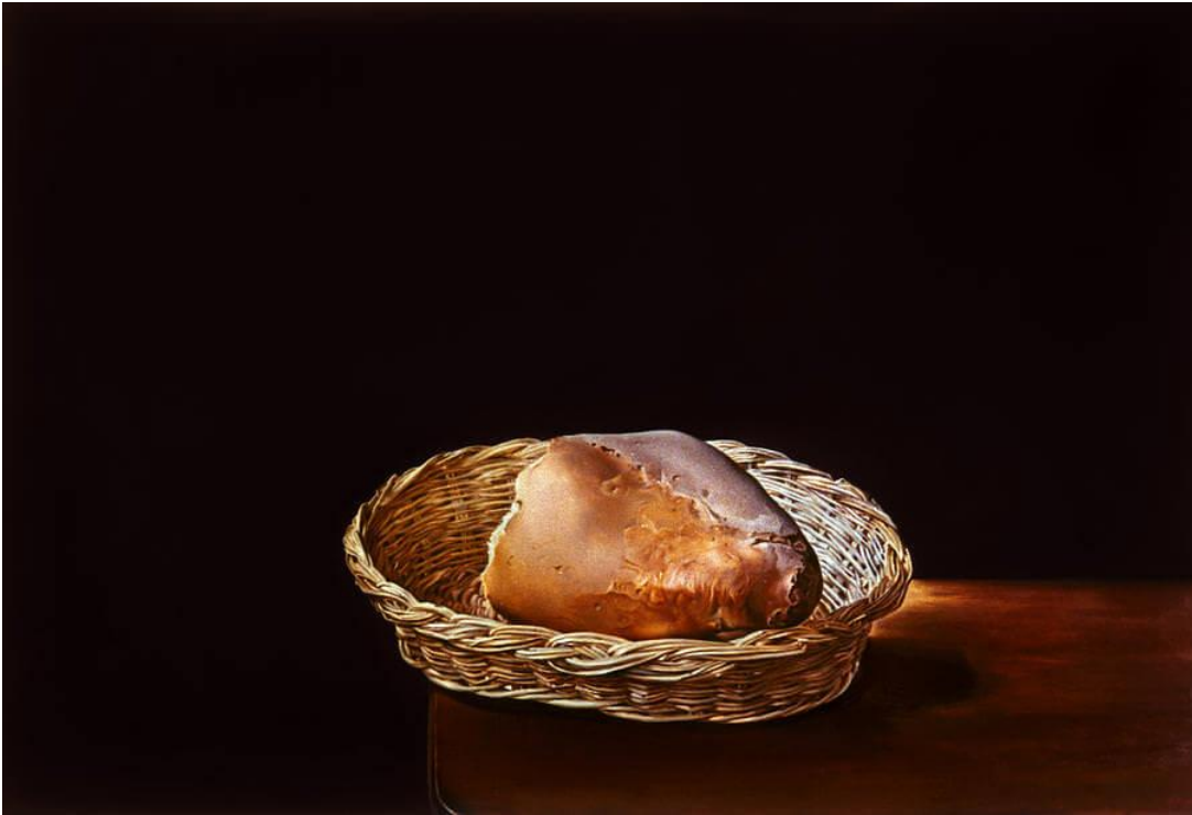
"The Basket of Bread," Salvador Dali (1945)