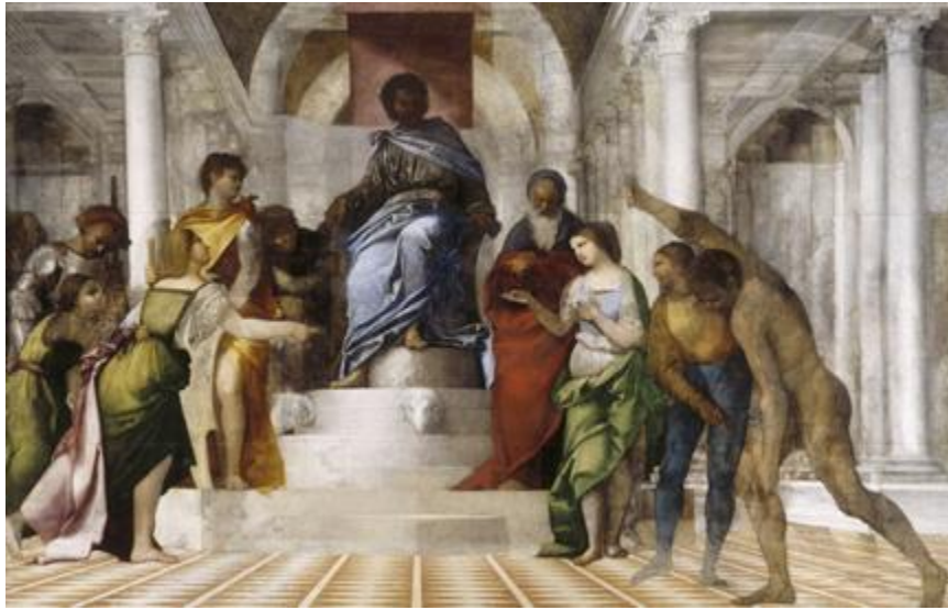
"The Judgement of Solomon," Sebastiano del Piombo (1485-1547)