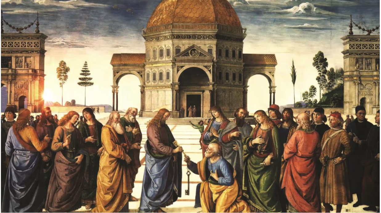
"Delivery of the Keys," Pietro Perugino (1452-1523)