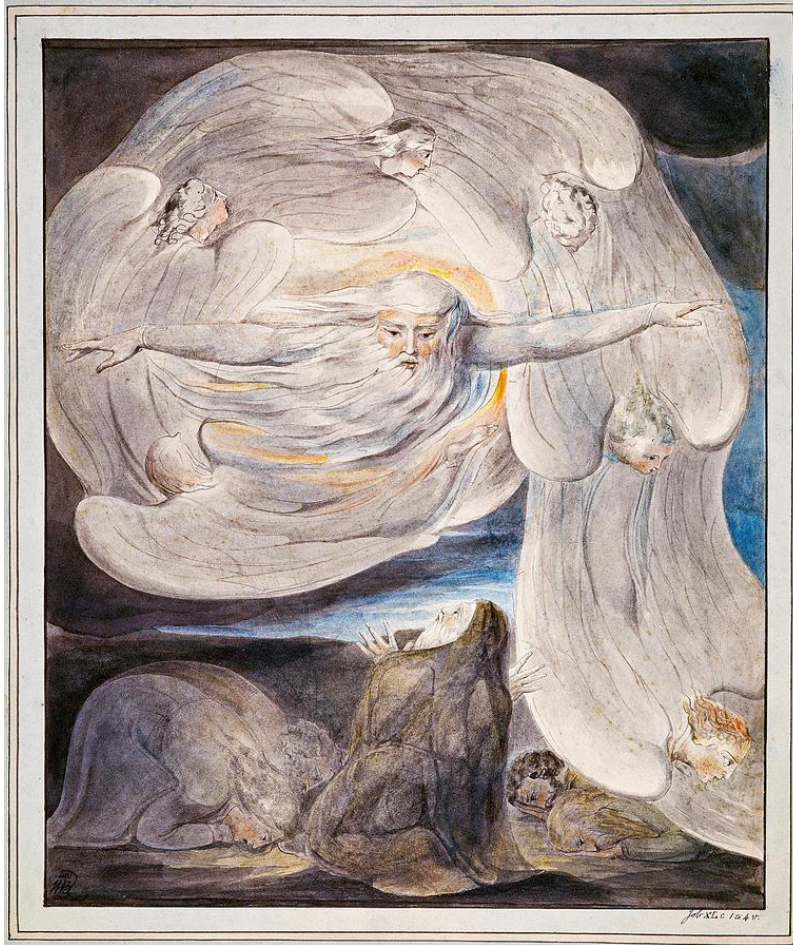
"Job and the Whirlwind," William Blake (1757–1827)