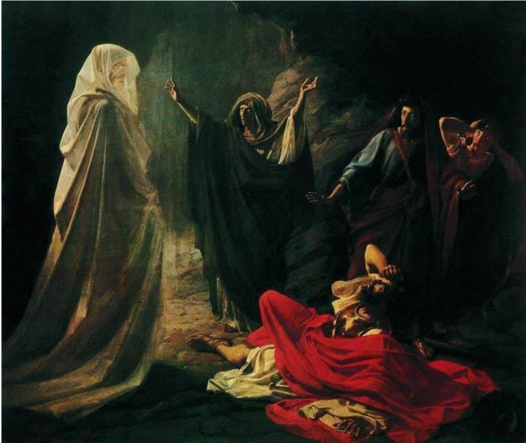
"The Witch of Endor," Nikolai Gei, 1857