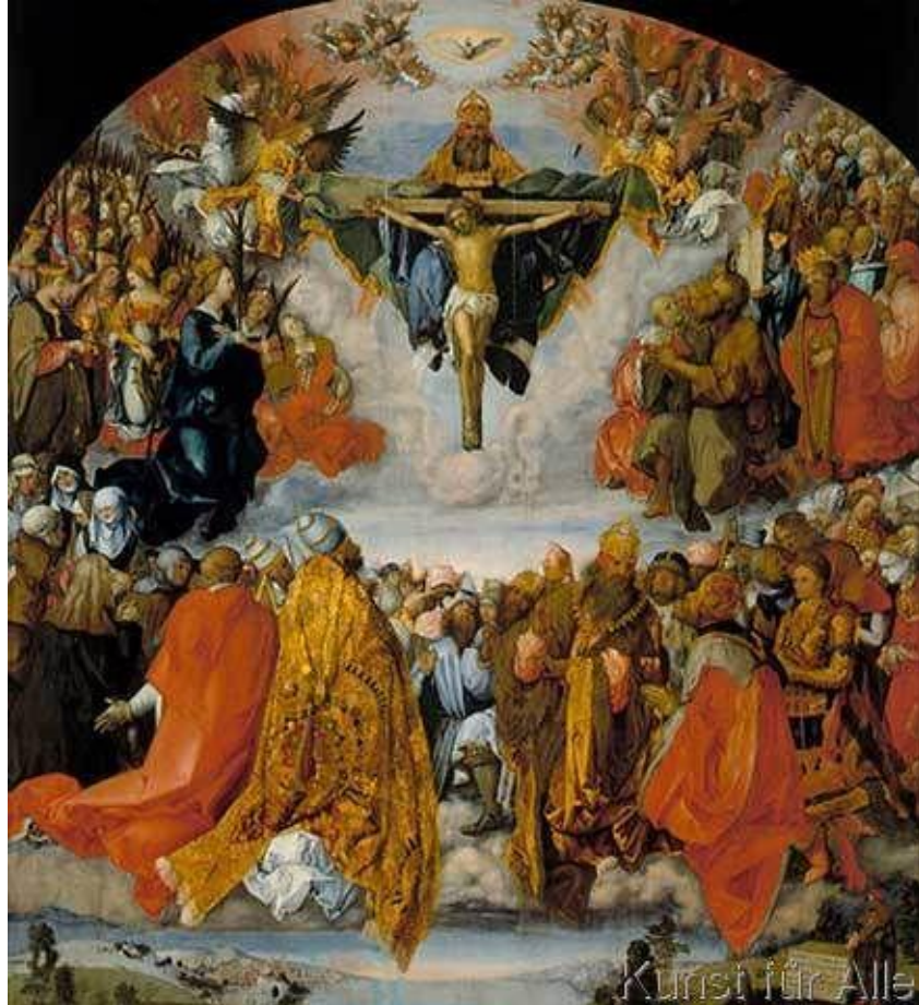
“All Saints’ Day,” Albrecht Dürer (1511)