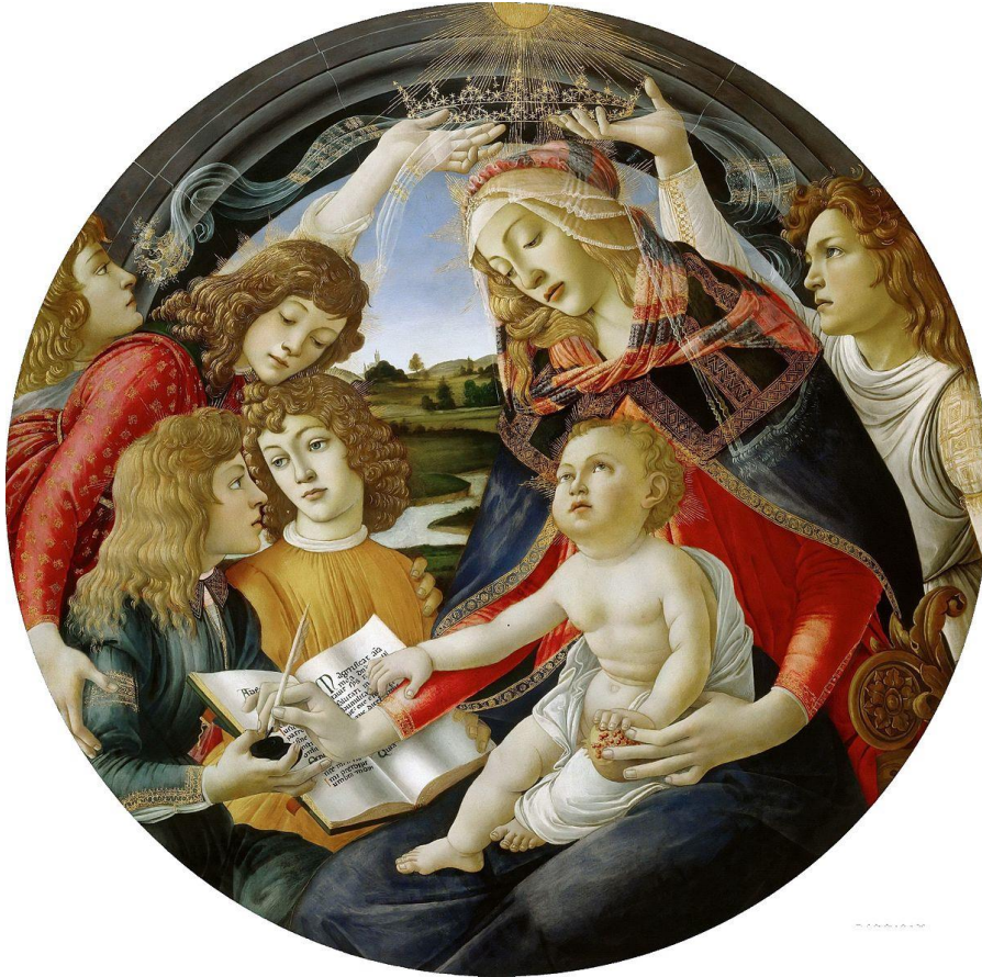
Madonna of the Magnificat, ' Botticelli, 1481 '