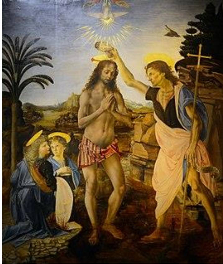
'The Baptism of Christ,' Leonardi da Vinci 1745