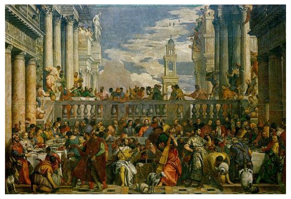
"The Wedding at Cana of Galilee," Veronese