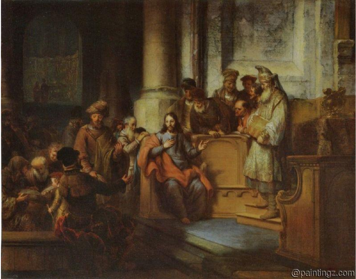
'Christ Teaching at Nazareth,' Gerbrand van den Eekhout (1621-1674)