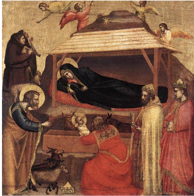
"The Epiphany," Giotto di Bondone, c. 1320