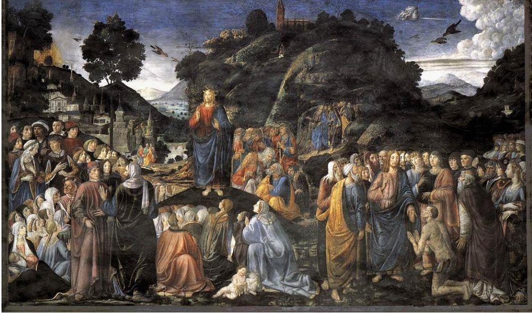
Jesus Teaching, Cosimo Rosselli, 1439–1507