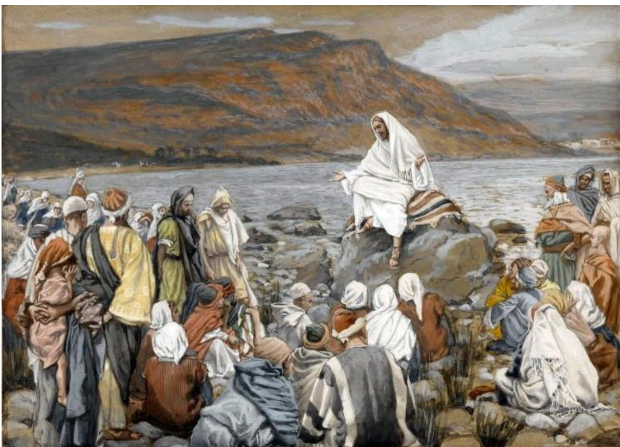
"Jesus teaches by the Sea of Galilee," James Tissot (1836–1902)