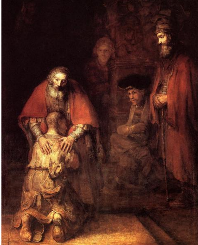
Return of the Prodigal Son, 1669 - Rembrandt