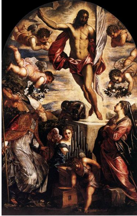
The Resurrection of Christ, Tintoretto, 1565