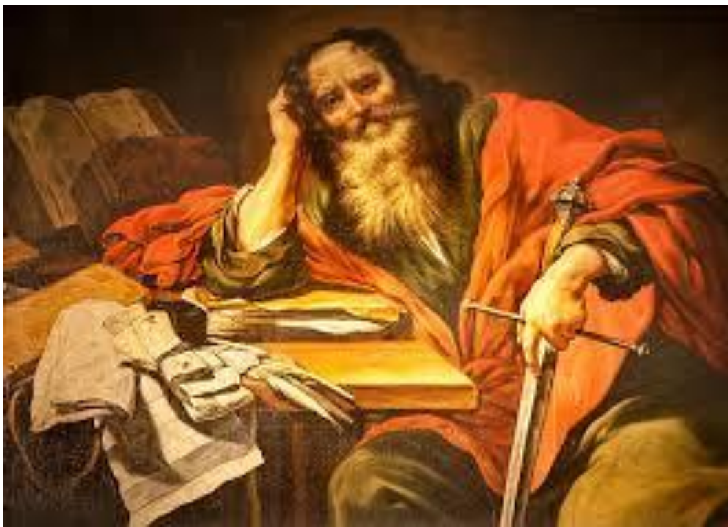
St. Paul, painting in St. Severin Church, Paris