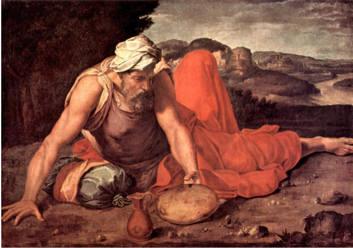
"Elijah in the Desert," Daniele da Volterra, 1650-1660