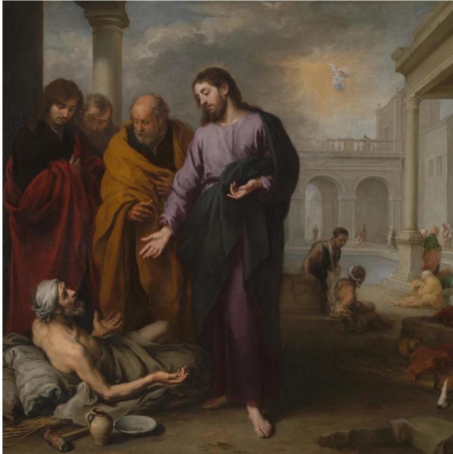
"Christ healing the Poor," Bartolomé Esteban Murillo, (1667-70)