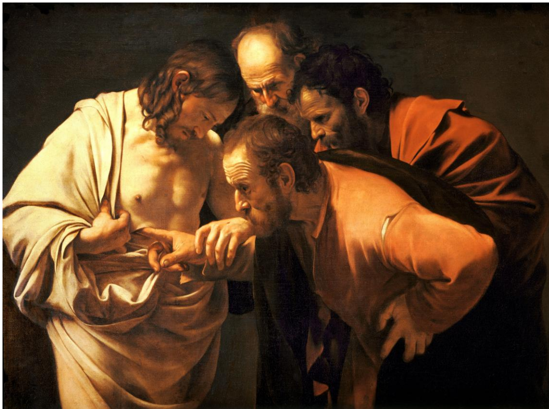
The Incredulity of Thomas, Caravaggio (1601-2) .