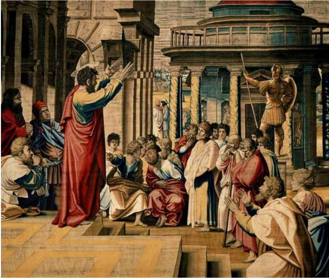
"Sermon of St. Paul in Athens," Raphael, 1514/5