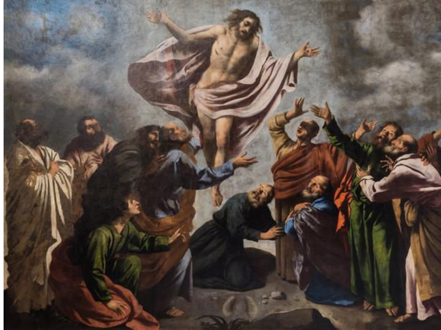
"Ascension of Christ," Pietro della Vecchia, 1626