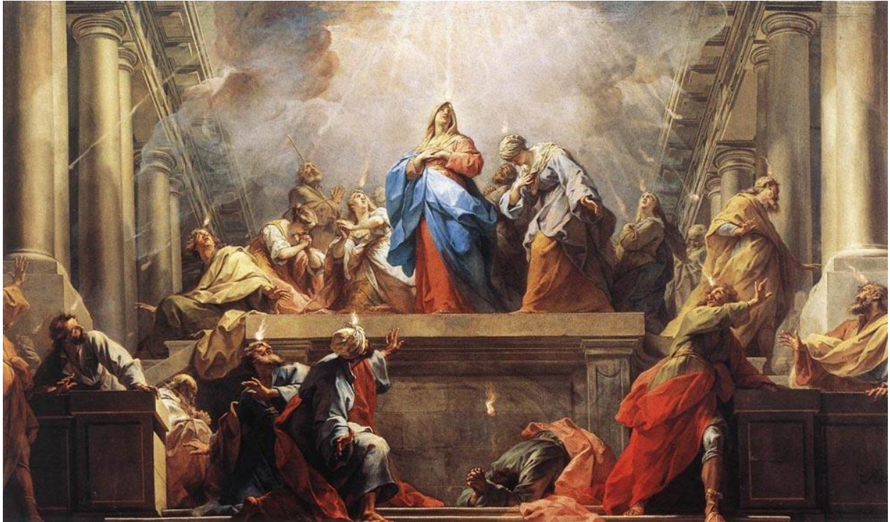
"Pentecost," Jean Restout II, 1732